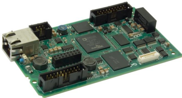
Card for inserting in power supply