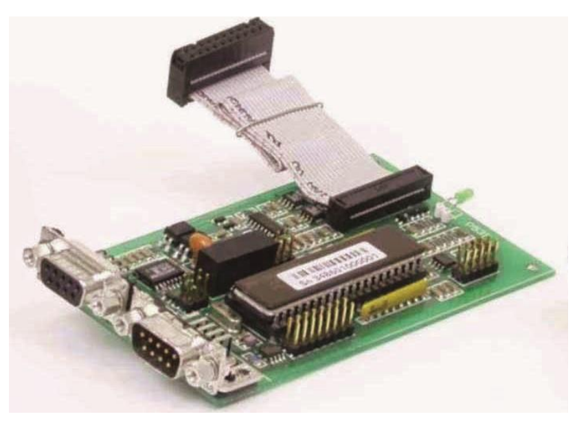
Card for inserting in power supply